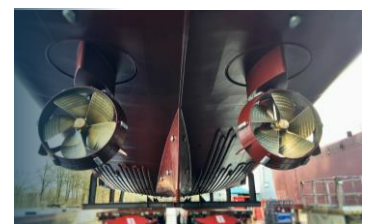
Technical & Engineering Services